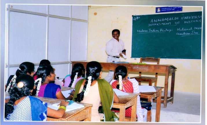
Soft Skill Development Training