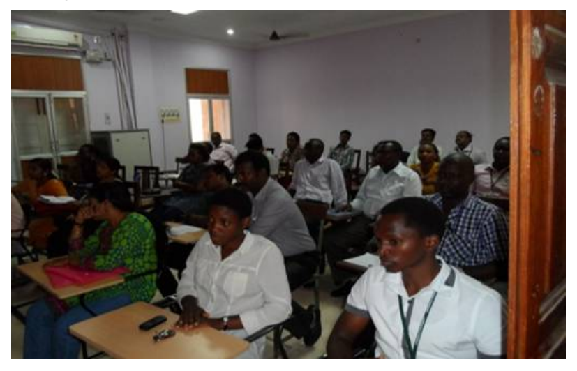
Hands-on Practice at the Departmental Computer Lab